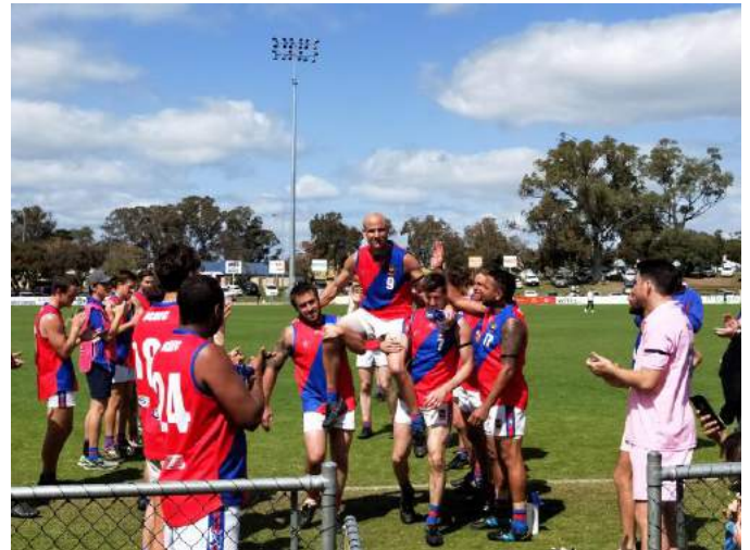
Ressies – Prelim Final