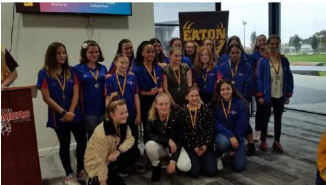
Year 7-9 Youth Girls Windup