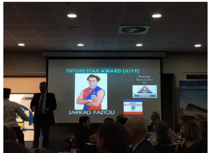
Faz - Future Star Award