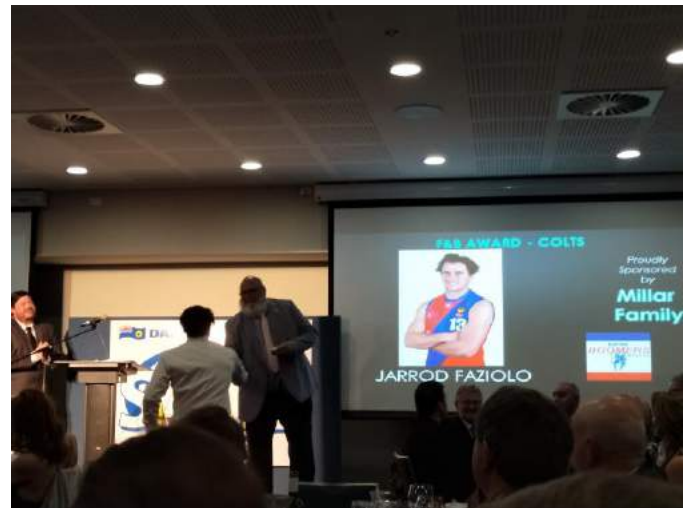
Faz - Landmark Colts F&B