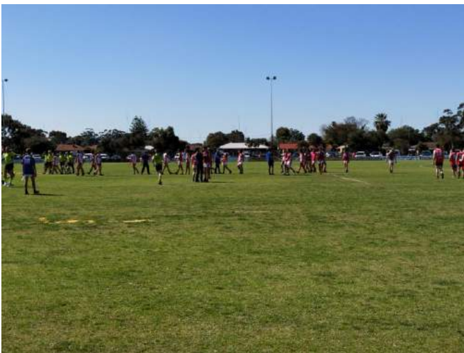
Colts 1 st Semi Final