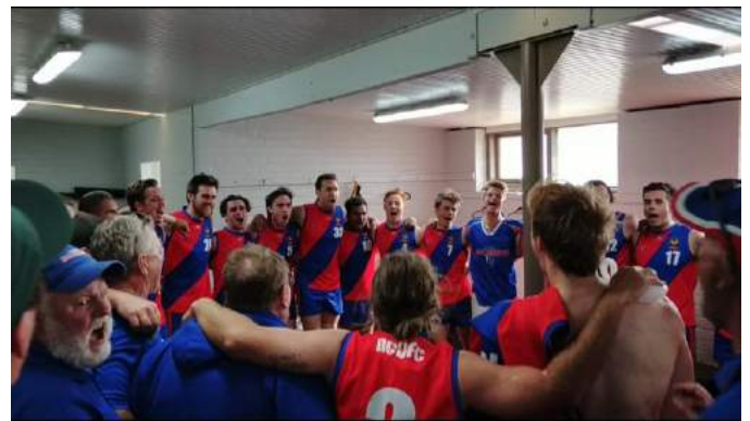
League Win through to Grand Final