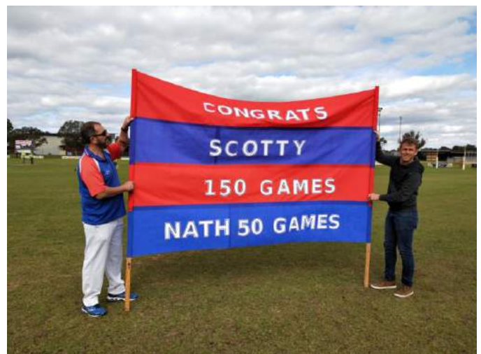
Scotty's 150 th and Nath's 50 th