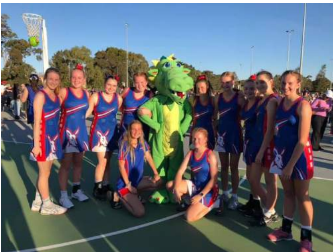
16's Netball at 2019 Association Championships