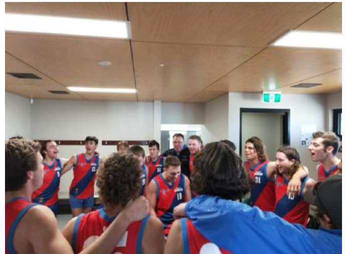
Colts celebrate win against HBL