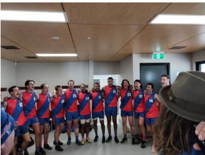
Reserves singing the song