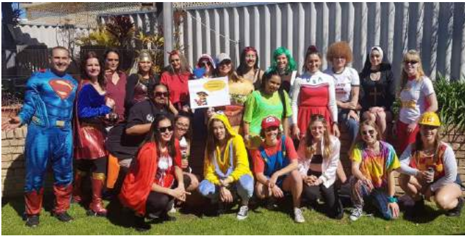
Women's Mad Monday