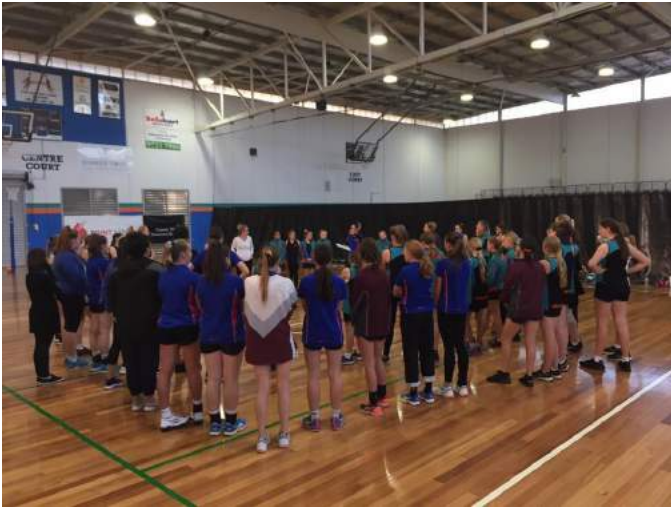
Boomers netball training session ENA