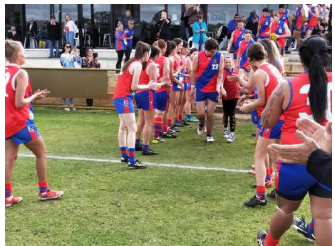
Scotty's 150 th