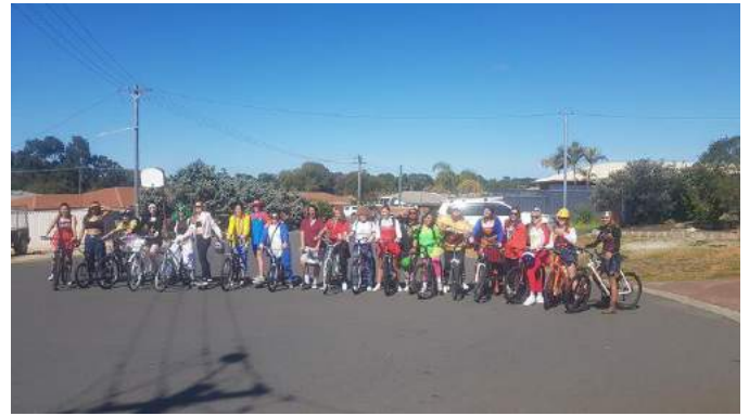
Women's Mad Monday