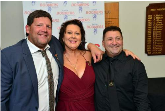
Our New Life Members