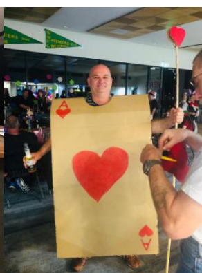
A couple favorites from functions held on the off season.