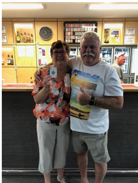
Lucky Chase the Ace winners- walked away with a jackpot of $1800!!