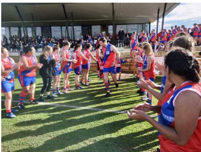
Pagey's 100 th