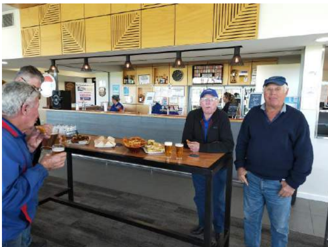
Past Players at our home games