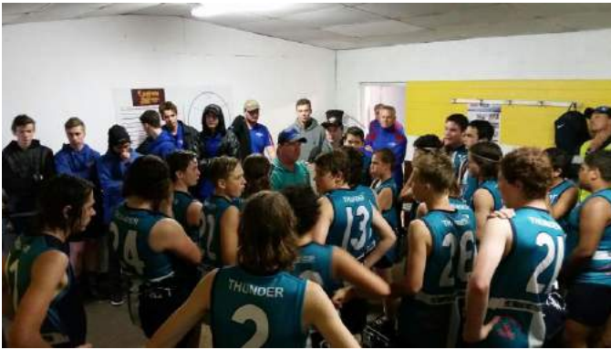
Colts support Preston Thunder Yr9