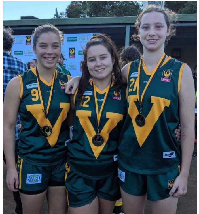
Women's Landmark Reps