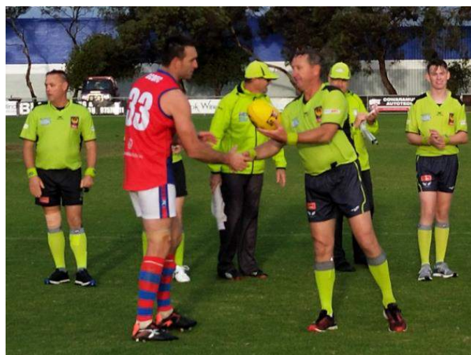
Pagey BOG Talk to a Mate Round