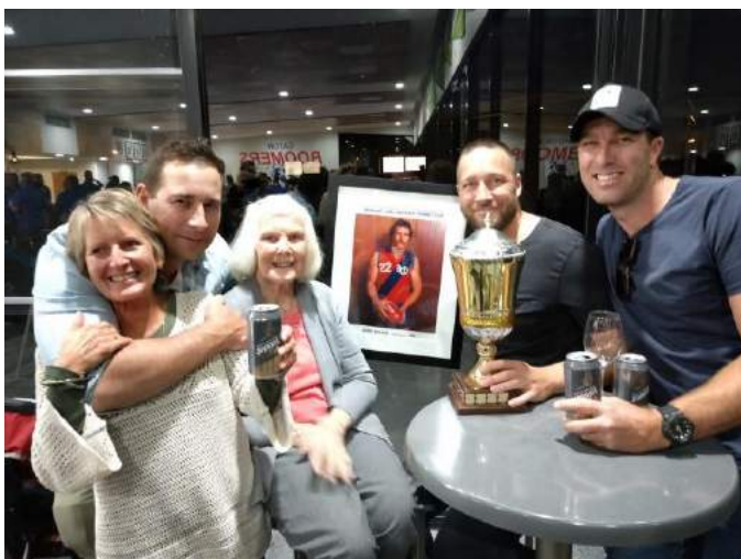
Peter Butcher Cup returns