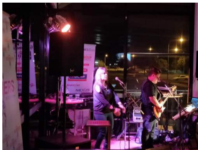
Double Trouble live