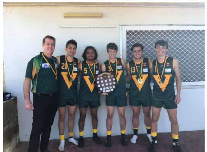
Colts Landmark Reps