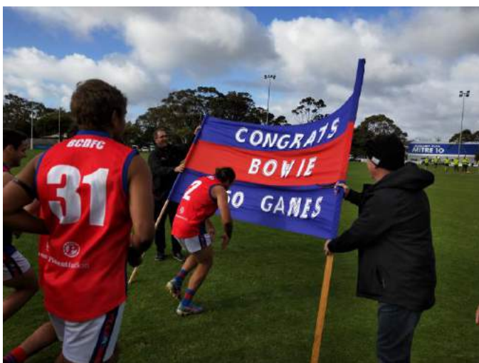
Bowie's 50 th