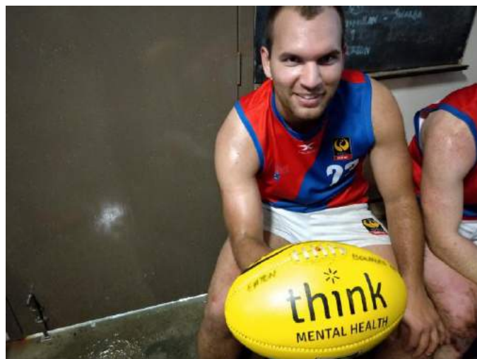
Think Mental Health Round