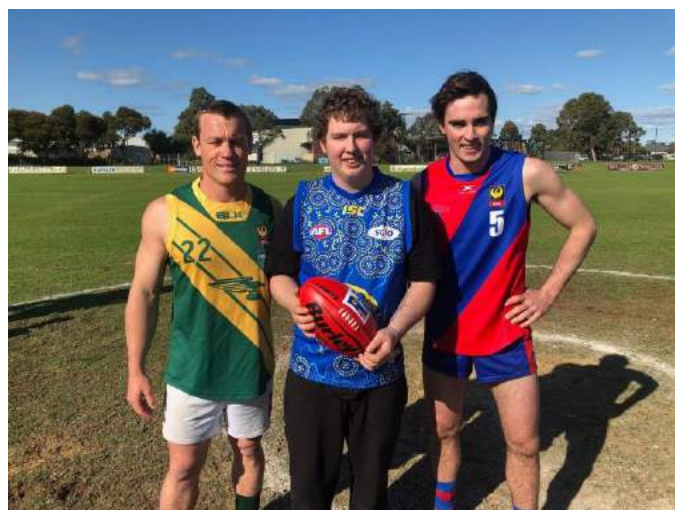
SWFLUA Match Day Experience